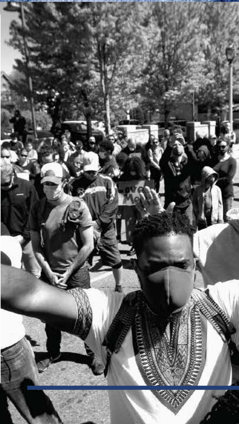
CITY-WIDE PRAYER WALK, MAY 2020

John's heavenly vision in Revelation 7:9-10 is an image that anchors us as a church: that one day, people from every tribe, tongue, and nation will gather together and worship the Lamb of God! This summer, as the pain of racial tension has risen to a new high in our city and world, we are reminded again that what makes Eastbrook such a special place is our ability to celebrate the beautiful diversity of the Kingdom of God, while not sanitizing each other's experiences or diminishing each other's differences. Instead, we come together in diversity, in a posture of unity and humility, around the throne of Jesus Christ, to worship our risen King and Lord.